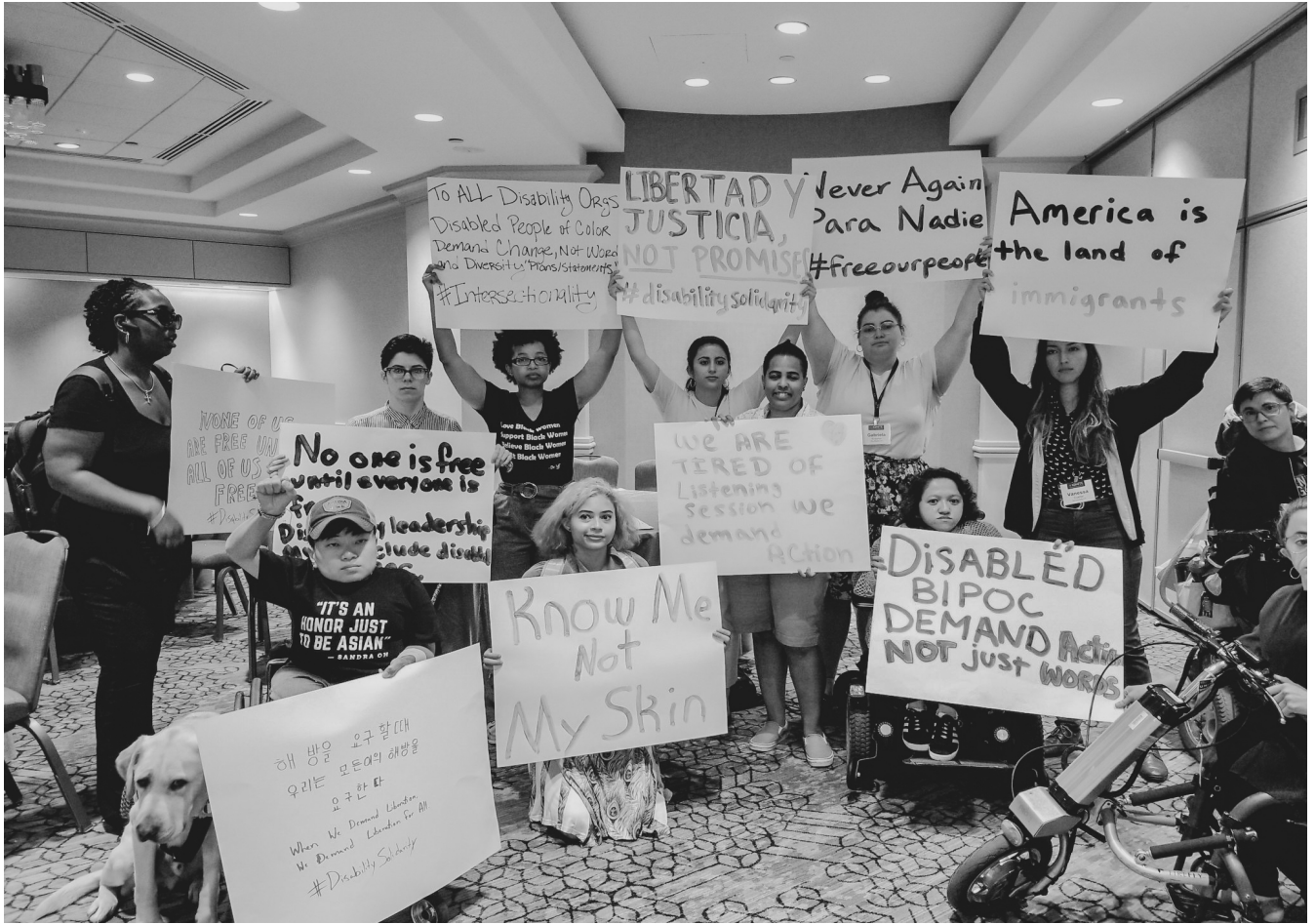
Image Description: a black and white group photo of disabled BIPOC and a couple of white allies holding signs that advocates for disabled BIPOC.