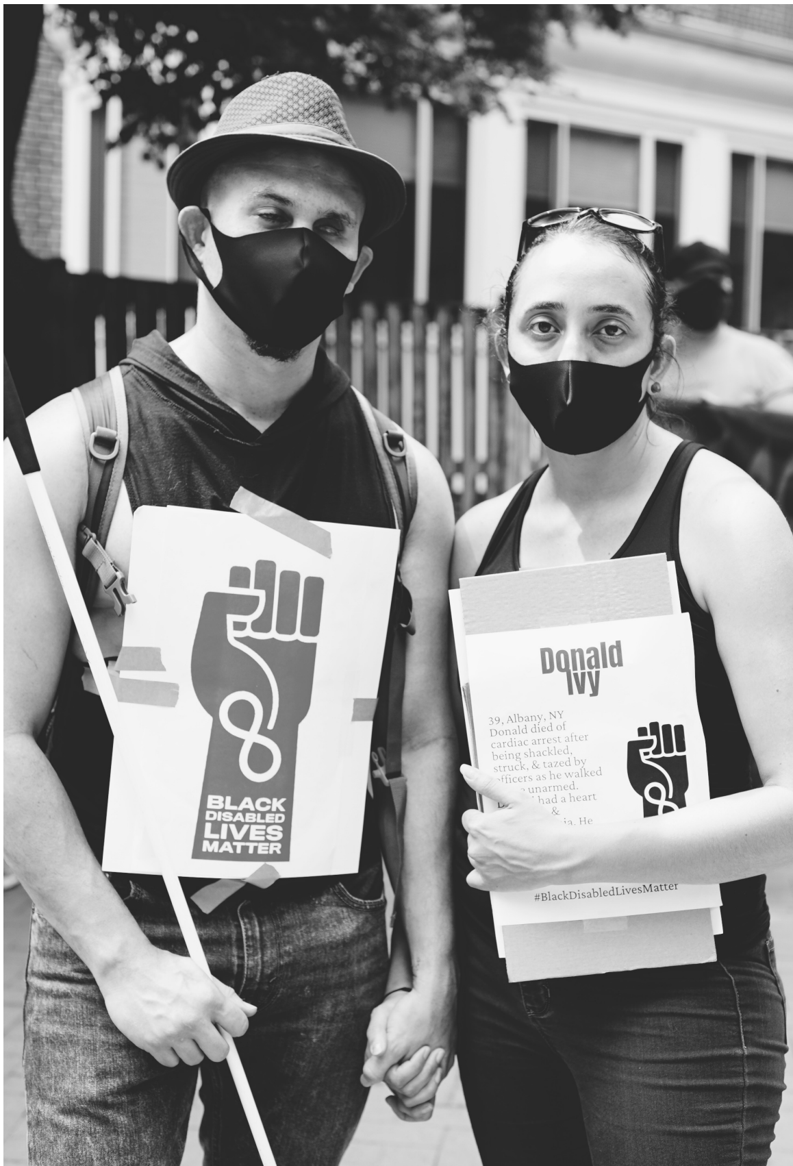
Image Description: A black and white image of two individuals standing outside holding signs about Black Disabled Lives Matter. They are both wearing masks and the person on the right is holding a cane.